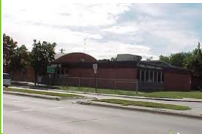
Little Free Library 25th & Potter St.