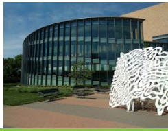
LFR Engine House #2